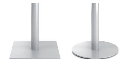
Tubular leg with square or round base plate