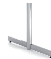
Standard T-leg or "Deluxe"