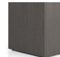
Architectural base, choice of corner detailing: wood, metal 90° or rounded.