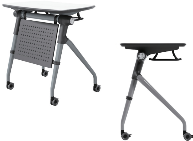
30" Wide Training Table Shown